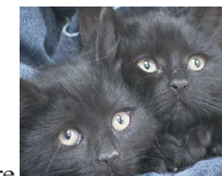
We can't tell them apart either.

Jet and Ebony are 3-month-old look-alike siblings with different personalities. While both are sweet, Ebony is shy and Jet is more social. We hoped the