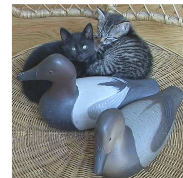
Feeling just ducky!

In closing, I'd like to thank you for being a friend of CLAWS. Over the years, these beautiful cats have brought